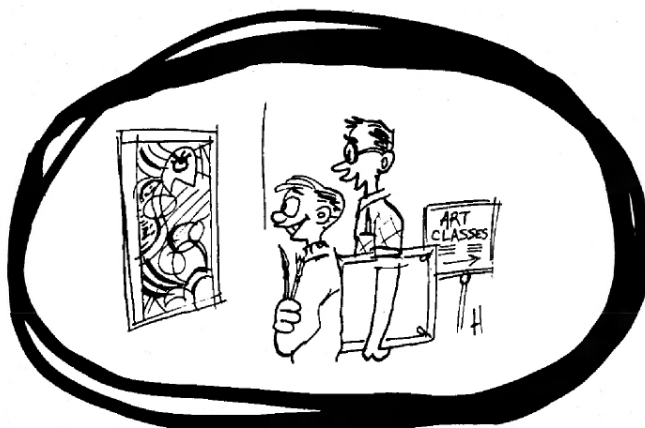
"Man—is she stacked!"

"He speaks as a pupil to his master," said I.